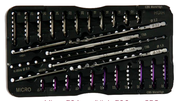
Micro Ø3.1mm/High Ø3.9mm CBS

Temporary fixation of the bone fragments with Kirschner wires enables a largely minimally invasive procedure and precise screw placement.